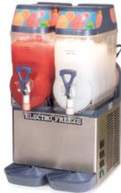
Model G102 G102F

Optional defrost timer can be preset to go into chilled mode during non business hours.