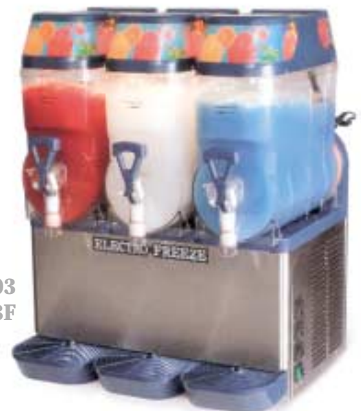
Model G103 G103F